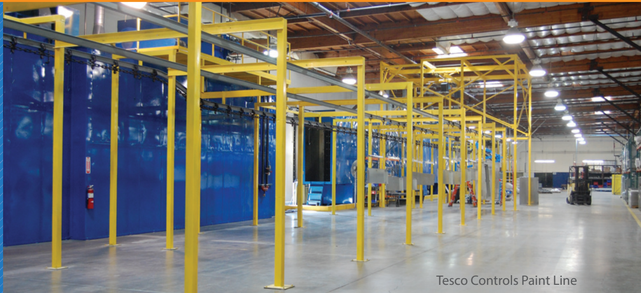
Tesco Controls Paint Line

TESCO CONTROLS, INC. 100% Employee-Owned